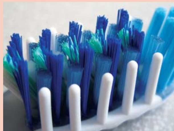
More complex toothbrush

their own toothbrushes look like and ask them to make a sketch. It is likely that students will have difficulty recalling specific details: whether the bristles are all the same height, the number of tufts in a row, the direction the tufts point, or the number of rows of tufts. After students share their drawings, distribute two different brushes to each group and ask students to compare them to each other. Help students realize that toothbrushes have a range of features. In the second part of the exploration, students will test to